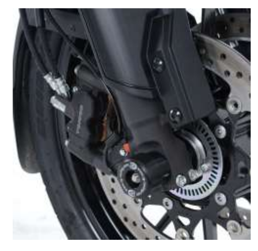
LE KIT CONTIENT LES ARTICLES EXPOSES CI-DESSOUS, VERIFIER QUE TOUTES LES PIECES SOIENT PRESENTES AVANT DE PROCEDER AU MONTAGE.