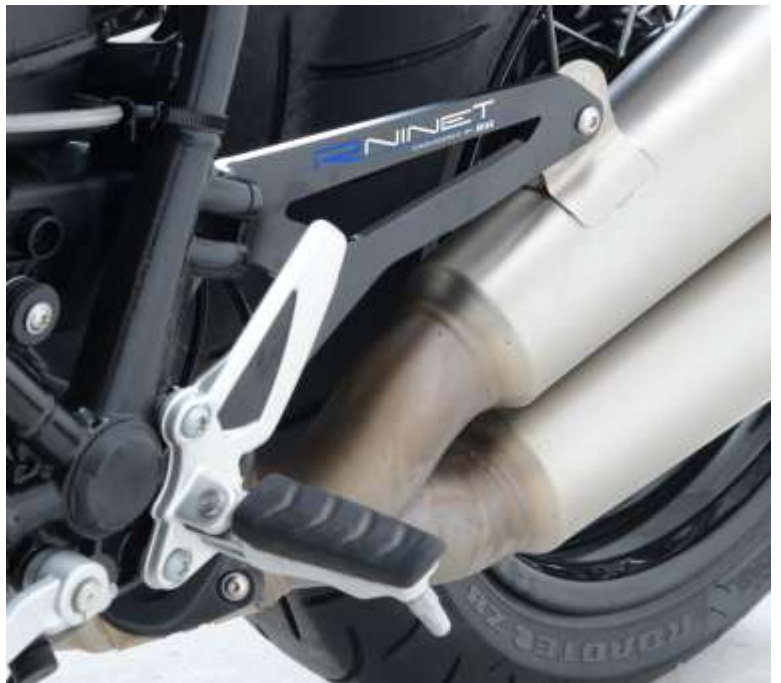
THIS KIT CONTAINS THE ITEMS PICTURED AND LABELLED BELOW. DO NOT PROCEED UNTIL YOU ARE SURE ALL PARTS ARE PRESENT.

Please note that the way the kit is packed does not necessarily represent the way of mounting to the bike.