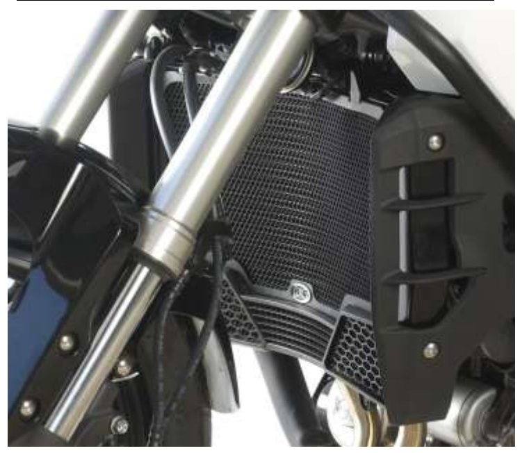
In This Kit There Should Be 1x Radiator Guard (RAD0122BK) 2x 100mm Lengths of self-adhesive Foam 1x 4mm Cable Tie x 220mm long