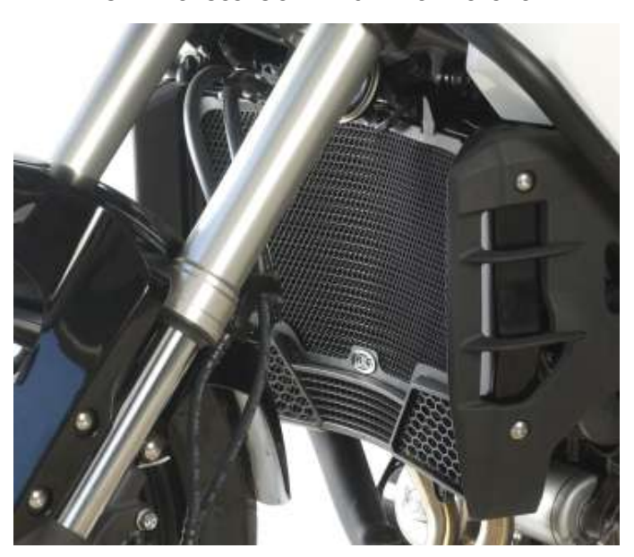
Ce kit doit contenir:

RAD0122BK Grille de protection radiateur HONDA CROSSTOURER 2012 DUAL CLUTCH