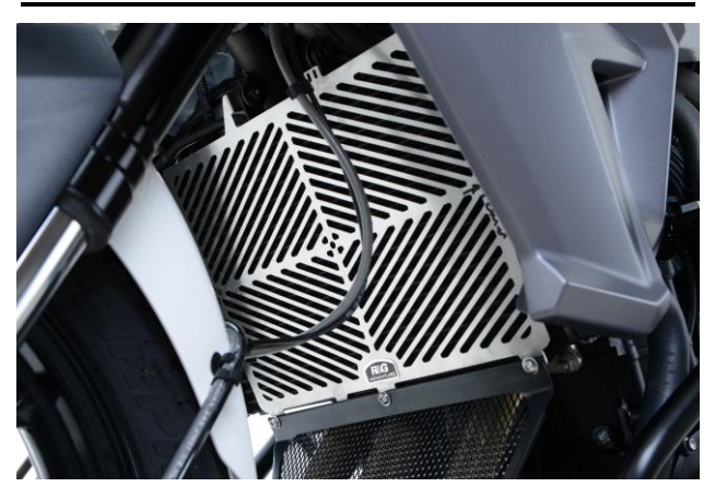
Le kit doit contenir : 1x Grille de protection radiateur (SS RAD0035) 4x 100mm Bandeaux autocollants 1 x Collier de serrage