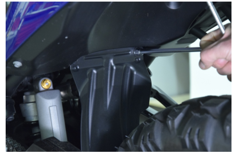
Remove the protective mudguard on the rear wheel as shown in the photo. You will not use the screws and the mudguard again, so you can save them if you want to restore it at the original form