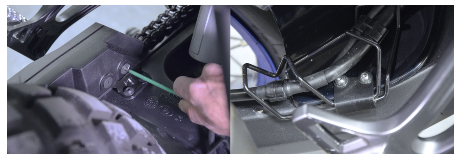
Then remove the screws that secure the chain guard to the inside only. You will not use these screws again (left photo).

Finally remove the base that holds the rear brake hoses. The base and the screws will be used again. (right photo).