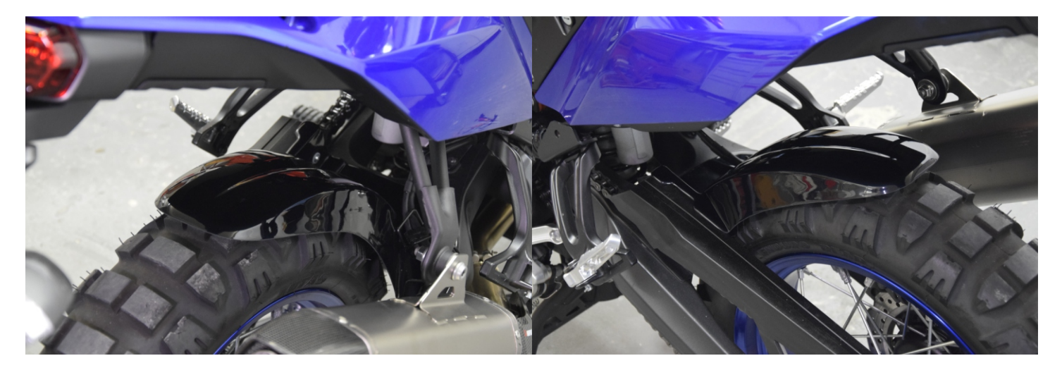
This will be the end result. Enjoy your clean rides!

Turn the base on the right side by placing the fender under it. Align the hugger and press the left screws first and then the right ones. Make sure the part is in place and tighten all the screws. Finally remove the protective film.