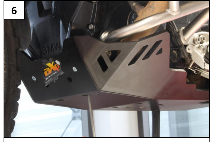
Place the front Tbhc 8x35mm screws with M8 Washers