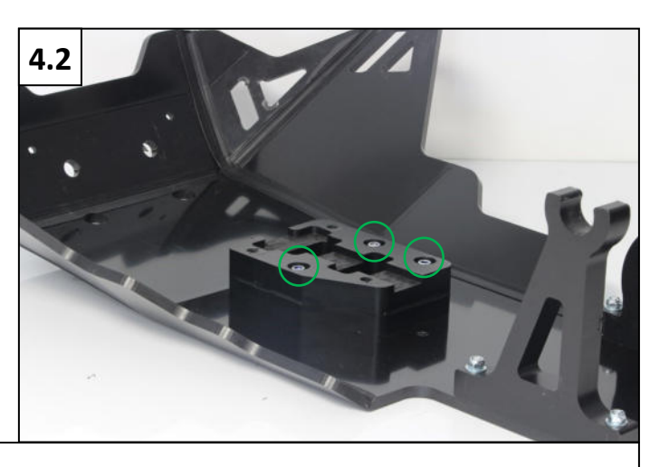
Fix the plastic block on the skid plate with 3 Tfhc 6x40mm + 3 Em6f + 3 M6 Washers