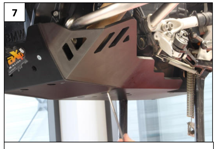
Place the 3 Tbhc 8x50mm screws in the middle of the skid plate with M8 Washers and tight everything

YOU CAN FIND MORE CONTENT ON OUR SOCIAL MEDIA AND FIND TUTO- RIAL VIDEOS ON YOUTUBE