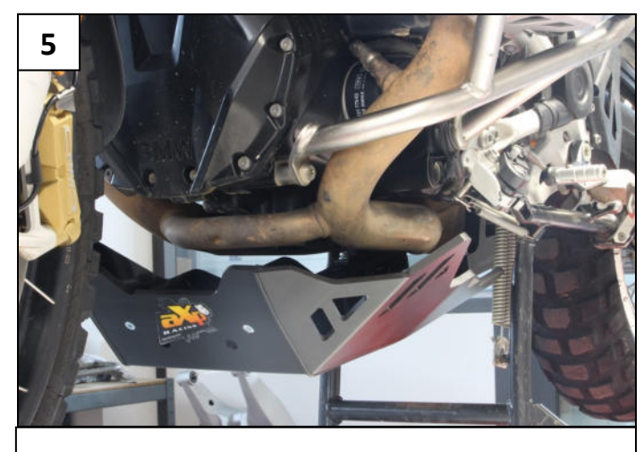
Fit the rear mount around the frame rear tube