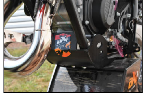
Clipser et fixer l'avant/ Clips and fix the front