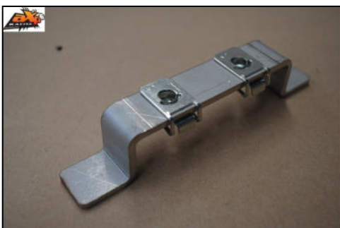
Préparer la fixation avant/ Prepare the front fixation