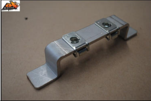
Préparer la fixation avant/ Prepare the front fixation