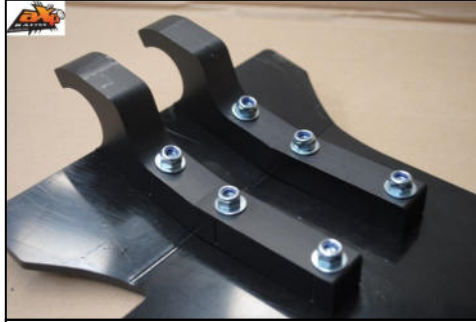
Fixer les fixations arrières/ Fix the rear fixations