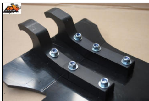
Fixer les fixations arrières/ Fix the rear fixations