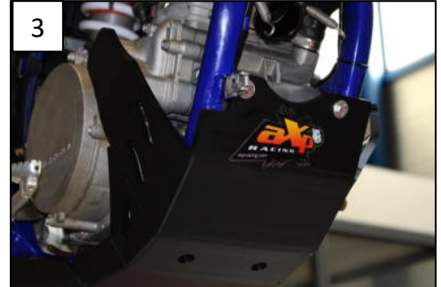
Fit the rear with the TH6x30mm Fixer l'arrière avec une TH6x30mm